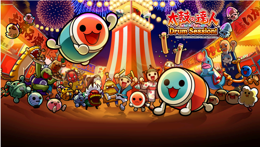
Figure 5a: Promotional image for Taiko no Tatsujin: Drum Session! (Bandai Namco 2017). A yagura bandstand is displayed in the center of the picture.

Through visual elements, Taiko no Tatsujin sets up a playful matsuri of its own, complete with food stalls, goldfish scooping, and of course the classic tower (or yagura ) bandstand, a centerpiece of the matsuri. The tower is prominently featured on the cover and promotional material of the Drum Session! (Bandai Namco 2017) iteration of the franchise (Figure 5a), and also appears on the menus and in certain stages of the game itself (Figure 5b).