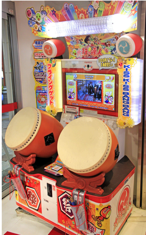
Figure 4: A Taiko no Tatsujin 2011 (Bandai Namco 2011) arcade cabinet.

setup is similar to the standard arcade iteration of Taiko no Tatsujin (Figure 4).