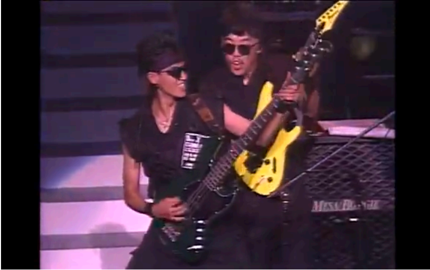
Figure 2: Members of the Sega Sound Team Band performing live. Still frame from Game Music Festival Live '90: Zuntata Vs. S.S.T. Band (1990). https://youtu.be/R_OPK0FBL8k

Taiko no Tatsujin participates in remediating geemu ongaku, since it features musical compositions from prominent digital game franchises. Starting from its 8th arcade version, Taiko no Tatsujin 8 (Bandai Namco 2006), geemu ongaku was featured as a distinct musical genre with its own dedicated playlist, alongside J-pop hits, anime songs, and other genres. A total of 12 geemu ongaku songs were included; tracks ranged from classic, easily recognizable tunes like the Super Mario Bros. (Nintendo 1985) and The Legend of Zelda (Nintendo 1986) respective main themes, to songs from the Bandai Namco franchises Tekken (Namco 1994) and Soulcalibur (Project Soul 1998). Also notable is the inclusion of the main theme of Darius (Taito 1989), a classic shoot 'em up arcade game. The remediation of geemu ongaku tracks in Taiko no Tatsujin also happens through collaboration and exchanges with other popular rhythm and music games. An example of this is the annual live event Tenkaichi Otogesai 2 (literally “The Universe’s Greatest Rhythm Game Festival”), which started in 2014 and