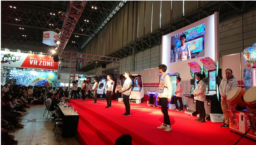
Figure 3: Players line up on stage at Tenkaichi Otogesai 2019, held at Makuhari Messe, Tokyo. https://twitter.com/AOU_Tenkatui/status/1089033903891931136/photo/1