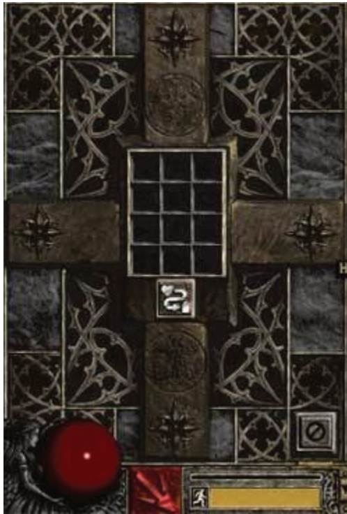
Figure 3 Diablo II 's Horadric Cube (crafting system interface)

1985), it appears to be Diablo II (Blizzard North 2002) that largely establishes the design element and player practice of crafting through the introduction of the Horadric Cube, a secondary grid inventory of 3×4 spaces that includes a button to transmute its contents into a new magical item (Figure 3). This provided a means for players to create endgame items beyond waiting for them to drop, and although its function was considered fairly arcane at the time, it was nonetheless a central part of many players' experiences of this game.