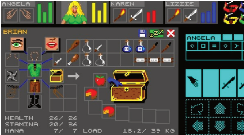
Figure 2 Inventory System in Dungeon Master