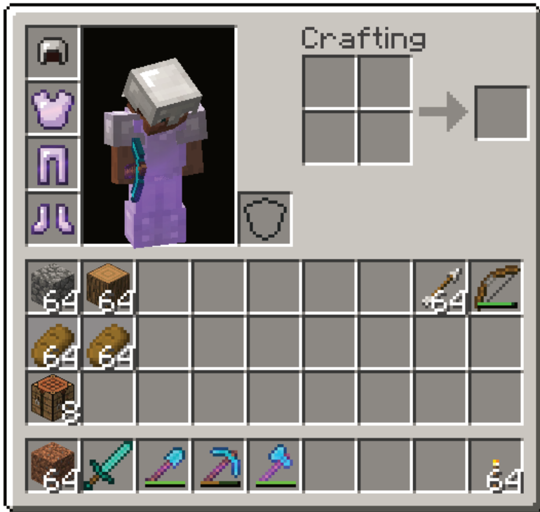
Figure 1: Minecraft Inventory System