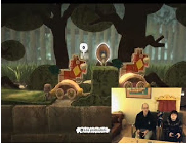
Figure 1. The ragdoll with the blue hair has just reached a spawn portal (highlighted circle) in Little Big Planet