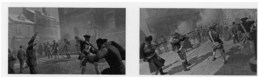
Figure 3: The start of Boston Massacre remains controversial in ACIII .

ly debated who instigated the blood bath, but it is known that several civilians were killed and wounded at the hands of British regulars stationed in Boston on March 5, 1770. In ACIII , the massacre is triggered by Templars in order to frame Connor Haytham, though the reason for this framing is unclear to the player at the time of the incident (see Figure 3). This reflects the many unknowns surrounding the actual cause for the firing outburst, and by design, May stated in the collector's guide, the use of a fictional character like the Templar to instigate the carnage "puts an end to the discussion about 'who started it' (Beatty & Pargney, 2012, p. 322).