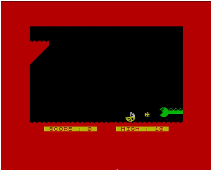
Figure 3: Typed in games of the 1980s – ZX Caveman

These early games are missing from most histories of videogames as they are frequently authorless, often copies of arcade games and not valued as design (Swalwell 2008). They were, however, many people's first encounter with both games and computing.