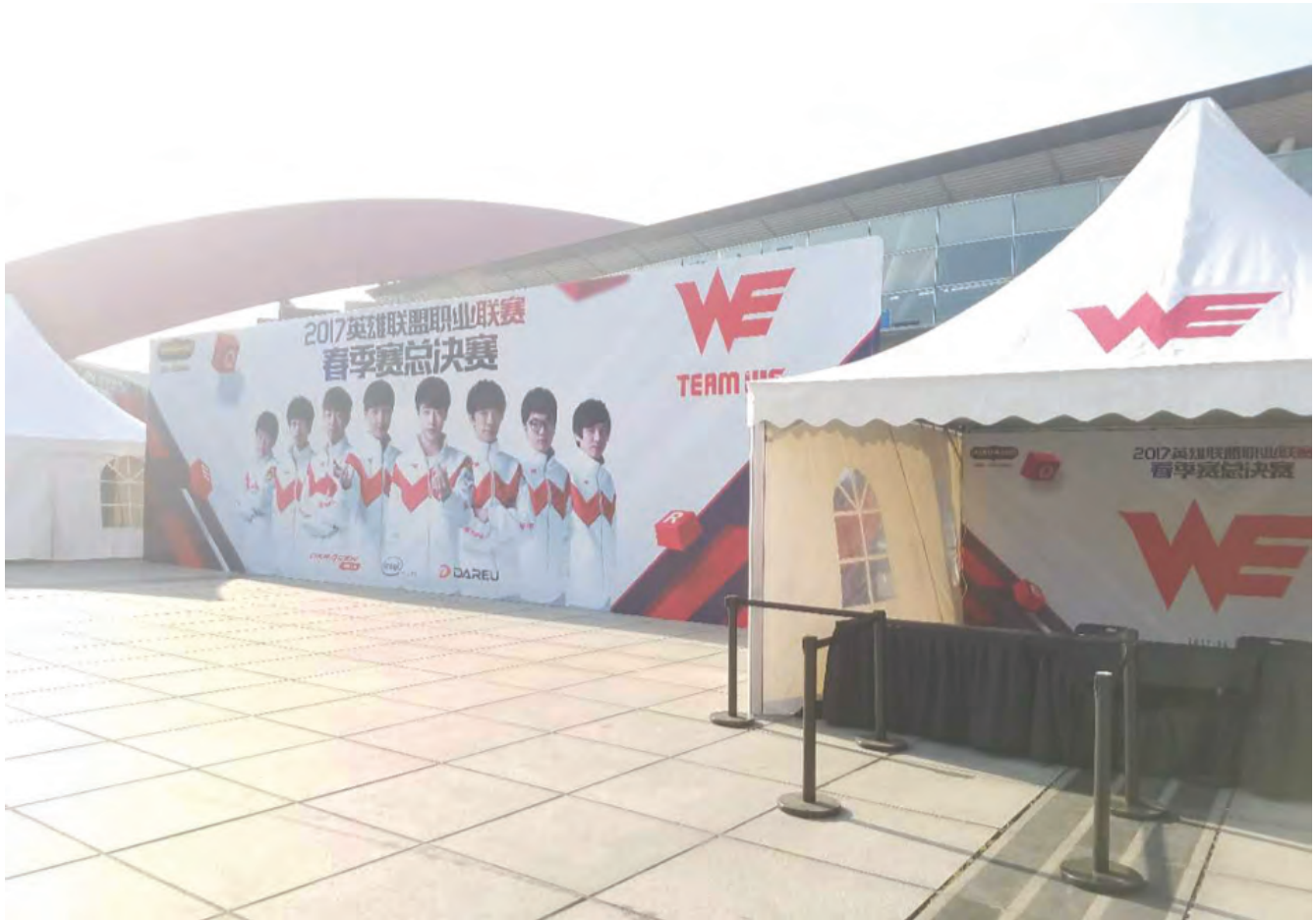
Image 2.6.1. Team WE's venue for fans gathering before the LPL tournament in 2017.

part in any “unauthorized” interview or other business function. Still, the state media is sometimes granted opportunities to interview pro-gamers, since official attention can serve both as a promotion of the gaming team and as a form of political propaganda promoting China's national image. Image 2.6.2 shows the transcript of an interview in China Daily with a member of another prominent organization, Team RNG, explaining that “he is honored to participate in competitive gaming at the global level, and will try his very best to win for the country.” 30