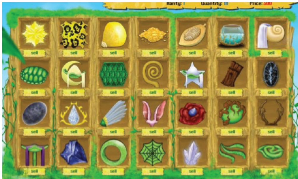
Figure 2. In-game screenshot of the relics collection interface.