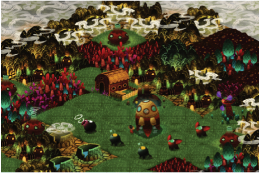
Figure 2. Screenshot of player's developed landscape in Terra.