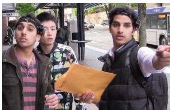
Figure 2: Hand-held camera view

These cameras captured audio of the camera wearer and the group. A third member of the group wore a wireless microphone that fed audio to a third, hand-held camera operated by a member of the research team (figure 2).