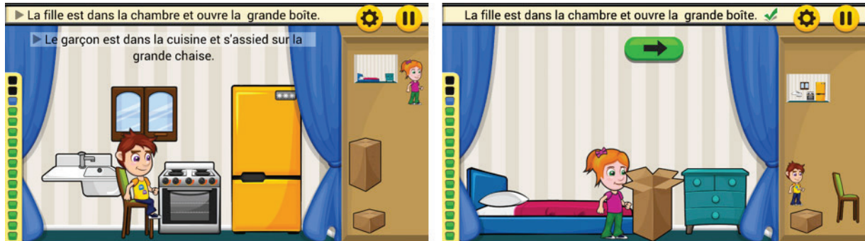
Figure 3: Levels of increased semantic complexity.

Our game introduces over 200 words in various semantic contexts. Players progress in a way that ensures progression and learning without the player being able to guess what comes next. Additionally, by staging scenes at various intervals, previously learned words are reinforced. Puzzles become increasingly complex (see Figure 3) throughout the game. The number of possible descriptive sentences that can be invented before the completion of the puzzle increases dramatically as the target sentences become more complex. In total, our game produces tens of thousands of different sentences because of this emergent complexity.