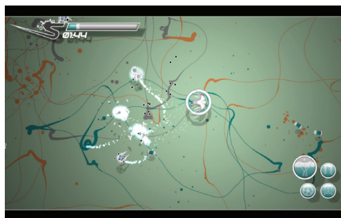
Figure 1: In-game screenshot of Splattershmup: A Game of Art & Motion with green background, and player-selected palette.