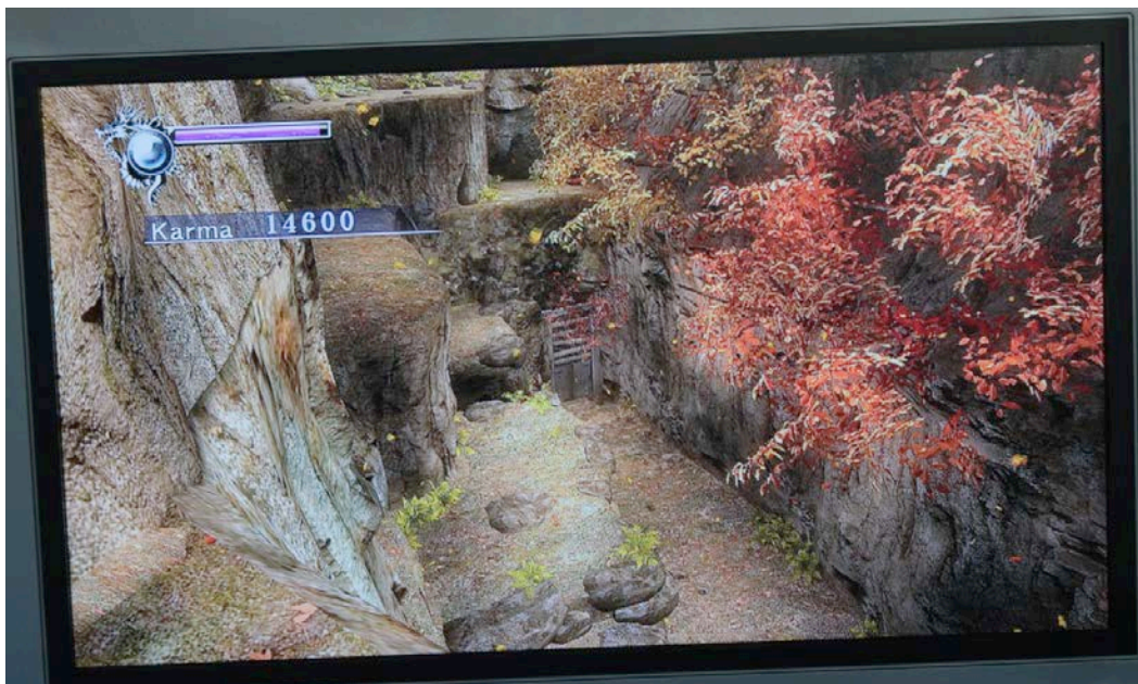
Figure 1: The Riverbed the player must escape from. No enemies! No chance of failure! ...But no instructions, either.

The very first level of the game, the player stands in a riverbed. There are no enemies attacking the player, but also no instructions for where to go, or how to get there. So, the player simply has to press buttons and figure out how to move, how to jump, and how to get out of the riverbed. For a game that will later be very intense and require quick reflexes to survive, this beginning scene is surprisingly calm.