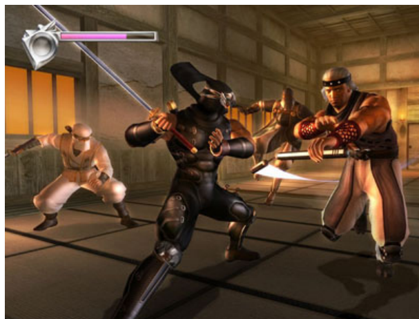
Figure 3: Combat with Ninjas that mimic the player make the player very aware of her own strengths and weaknesses, lessons that can then be used to fight all sorts of enemies.

Halfway through getting out of the riverbed, a few ninjas attack. The player can try out the attacks she has learned, and see that they have a solid effect. Thus, the traditional pattern of a beat-em-up is established, without actually instructing the player. But a curious thing happens – The enemy ninjas are aggressive. So aggressive, that they attack where they know the player is going to land when she rolls or jumps. The player now has to use jumping and rolling as an evasion tactic, or aggressively attack using moves discovered only minutes before. (If the player did not accidentally hit an 'attack' button during experimentation, they will likely flail about on the gamepad looking to discover the button at this point. Since the attacks are tied to the front buttons on the gamepad, they will likely be easy to discover, and the player will learn that way, instead.) This rapid processing of skills is a direct result of pressure by the game system, providing a negative feedback when the player is not at a high enough skill level. While there is a certain amount of skill necessary to get to this stage, once the player is at this stage, she can learn rapidly using this pressure-based experimentation.