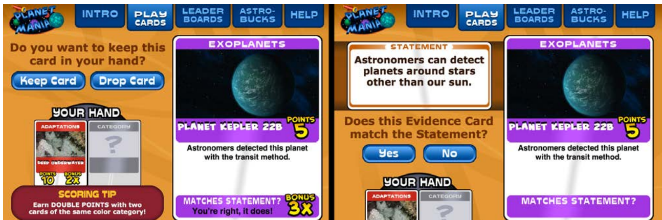
Figure 2: Revised Game with two-part matching and choosing sequence

With less than two months before the exhibit opening, we drastically simplified the game design and completely redesigned the core tasks in the game. In the pilot version of the game, players collect seven cards and then choose the four cards that best support the hypothesis. In the revised game, players collect five cards, and upon collecting each card, make two decisions: 1) whether it matches the statement and then 2) whether to keep it in their two-card hand or drop it (see Figure 2).