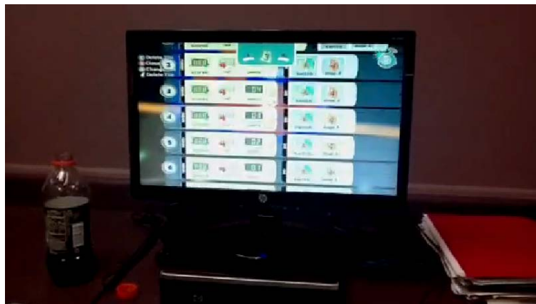
Figure 2: Screenshot of student programming in Kodu.

The course is geared to critically examine the history, usefulness, and elements of gaming with repeated opportunities to explore the mechanics, dynamics, and aesthetics of game design. Games are created and designed collaboratively; no formal texts are purchased, instead free or low-cost websites, videos, and game-based platforms such as The GameCrafter , Kodu , Scratch , ARIS , and Daqri comprise much of the project-based work. Gaming culture, experts, and organizations are threaded throughout the learning instances, and students collaboratively produce a short TED Talk taking a stance on an issue in the gaming industry. At the end of each term, students have experienced designing board, digital, and mobile games.