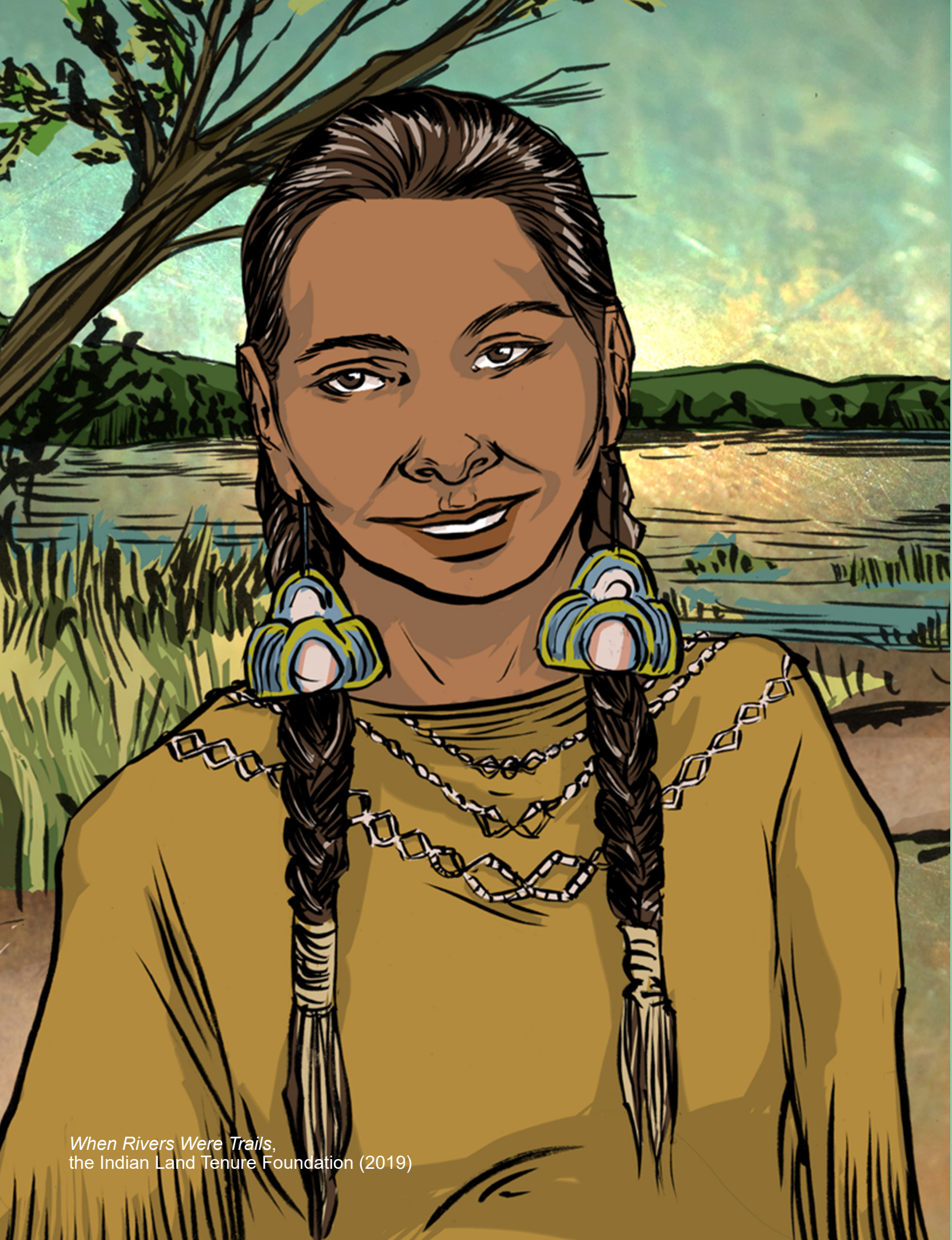
When Rivers Were Trails, the Indian Land Tenure Foundation (2019)