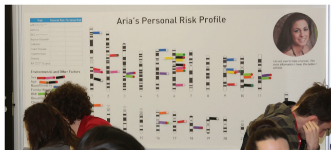
Figure 1: Material intensive Risky Business activity.

The initial idea for an activity to engage students in an exploration of the genetic, environment and family history factors that play a role in the development of common complex disease was formed during the summer of 2009 by an experienced educator and a group of summer interns working for HudsonAlpha Institute for Biotechnology. The activity, Risky Business, used a large printed sticker, magnetic foam flags and a magnetic white board to which the sticker was attached (see Figure 1). Hundreds of students pilot tested the activity in this form with great success. However the activity was material intensive limiting the ability to use it in area schools. A National Science Foundation Science Education Partnership Award (NIH-SEPA) was awarded in 2010 to make the transition from material intensive activity to computer-based interactive. In May of 2010, two members of the grant team attended the annual NIH-SEPA meeting and were introduced to good practices of online interactives and games. The decision was quickly made that Risky Business could not simply be reiterated on a computer screen, but needed major redesign in order to bring it into the world of serious games.