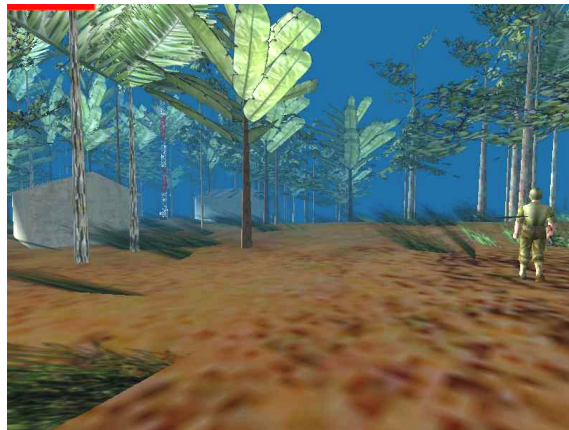
Figure 1. Screenshot of the Third World Shooter game.

Third World Shooter (see figure 1) began with several fairly lofty design goals. The history of the War of Independence is full of complex politics that could find analogy to the stalemates of the contemporary war on terror. The people seeking independence from the Portuguese colonial system were considered enemies of the state. To gain independence, the African Party for the Independence of Guinea and Cape Verde (PAIGC) used propaganda, sabotage and military action. As a Marxist group, funding and support for the liberating PAIGC often came from communist China and the then USSR. Despite the country's cold-war era allies, Cape Verde in particular has a very strong relationship with the United States.