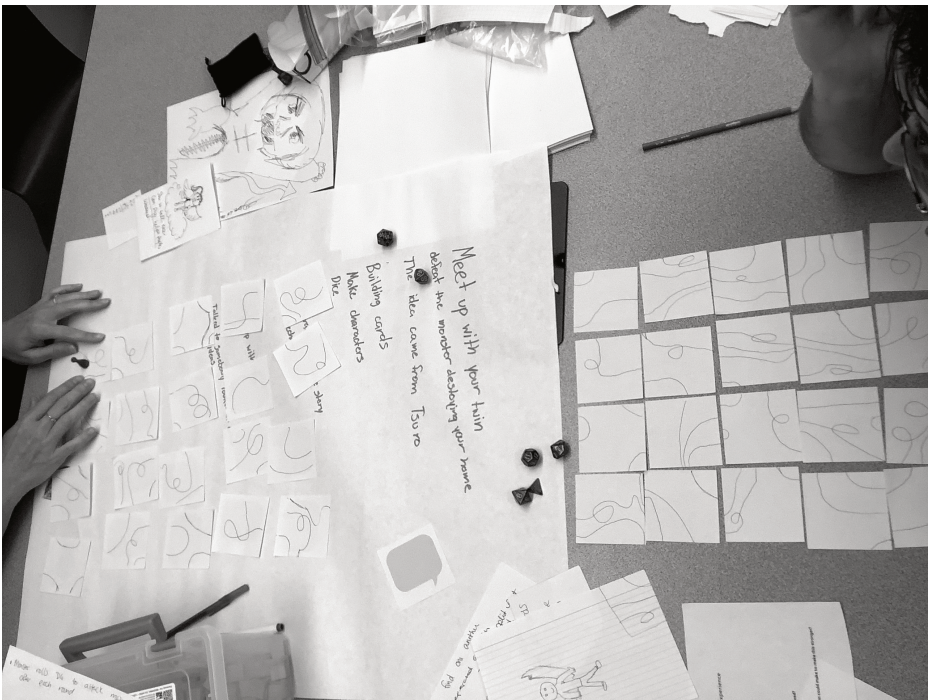
Figure 2. Chicken Nuggets prototyping Rotate .

If a player gets to the center (the opposite end of their tile game board), the monster attacks. That player then rolls the monster die (a d6 die) and subtracts that from his/her/their life points. The players then attack with a d6.